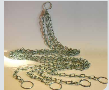
Photo: chain set for ceiling installation

Our globe mirrors 90° and 180° give a global overview in T-junctions and similar hazardous areas. These mirrors make the traffic movements in workplaces visible and reduce the chances of industrial injuries. The mirrors are placed directly on the wall or ceiling.